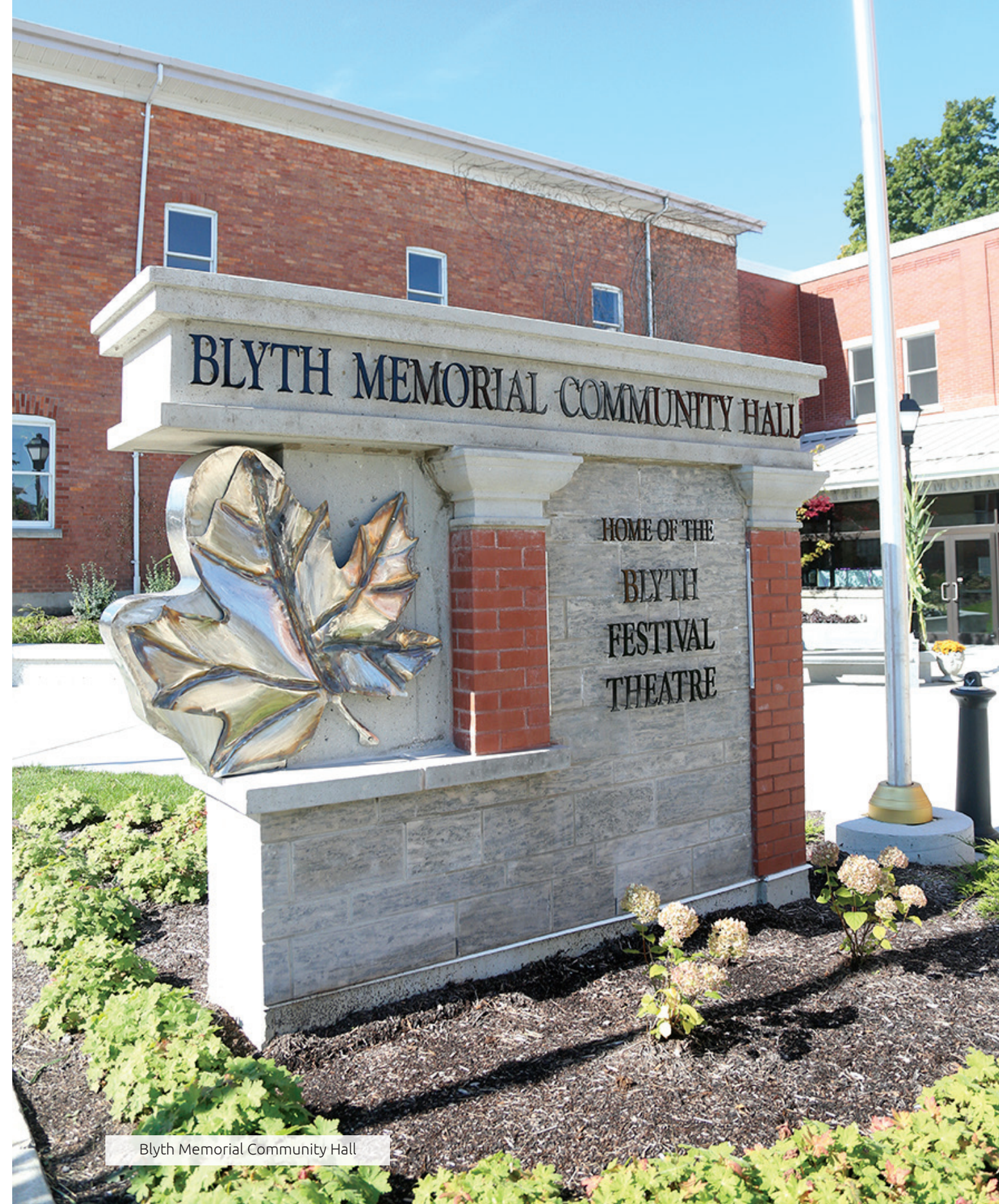
Blyth Memorial Community Hall

On day two, kick off your morning in Clinton admiring the animated murals brought to life with the Artvive app. Then, follow The Arts Trail on Highway 21 , curated by the Bayfield Centre for the Arts , showcasing galleries, studios, and public art. Stop for lunch at White Squirrel Golf Club & Restaurant and enjoy one of their wood-fired pizzas or casual dining menu options. Wrap up your cultural weekend with a matinee at the Huron Country Playhouse , offering a diverse lineup of live theater productions.