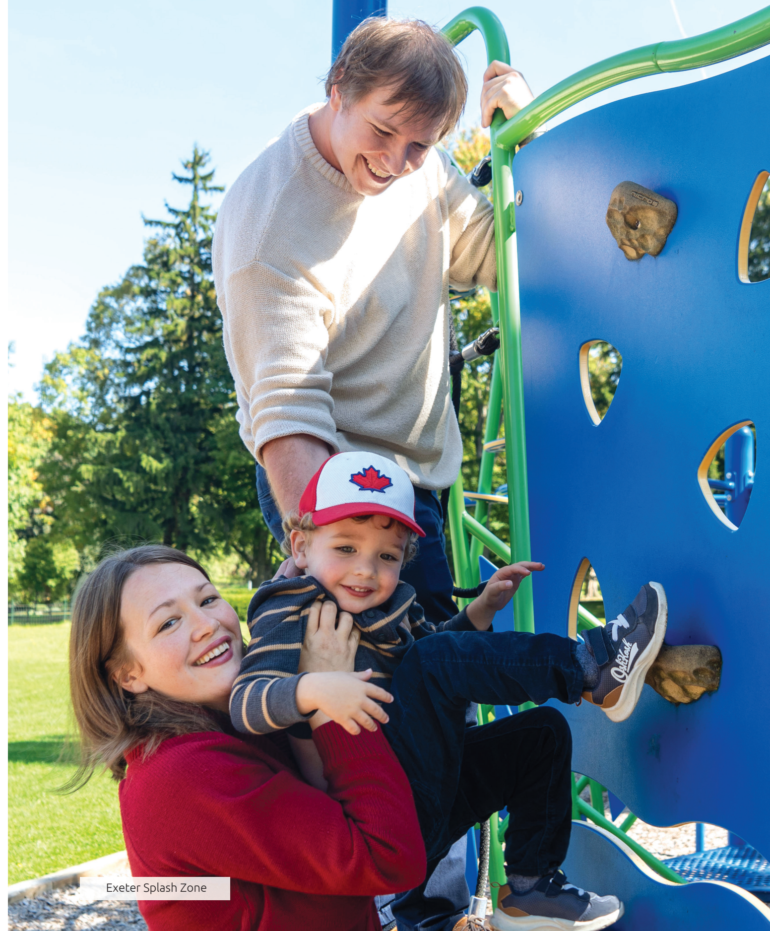
Exeter Splash Zone

Discover the 230-acre natural playground at Falls Reserve Conservation Area , featuring trails, a picturesque waterfall, and a stocked fishing pond. Stop for lunch and a round of mini putt at Sky Ranch Drive-In . Don't miss The Village Toy Castle for a playful experience with a mix of old-school games and summer fun toys. End your visit with a family dinner to remember at the White Carnation Banquet Hall . Their Sunday buffet features a lavish spread showcasing the freshest seasonal produce promising an unparalleled dining experience. Huron County awaits, offering unforgettable moments for the whole family.