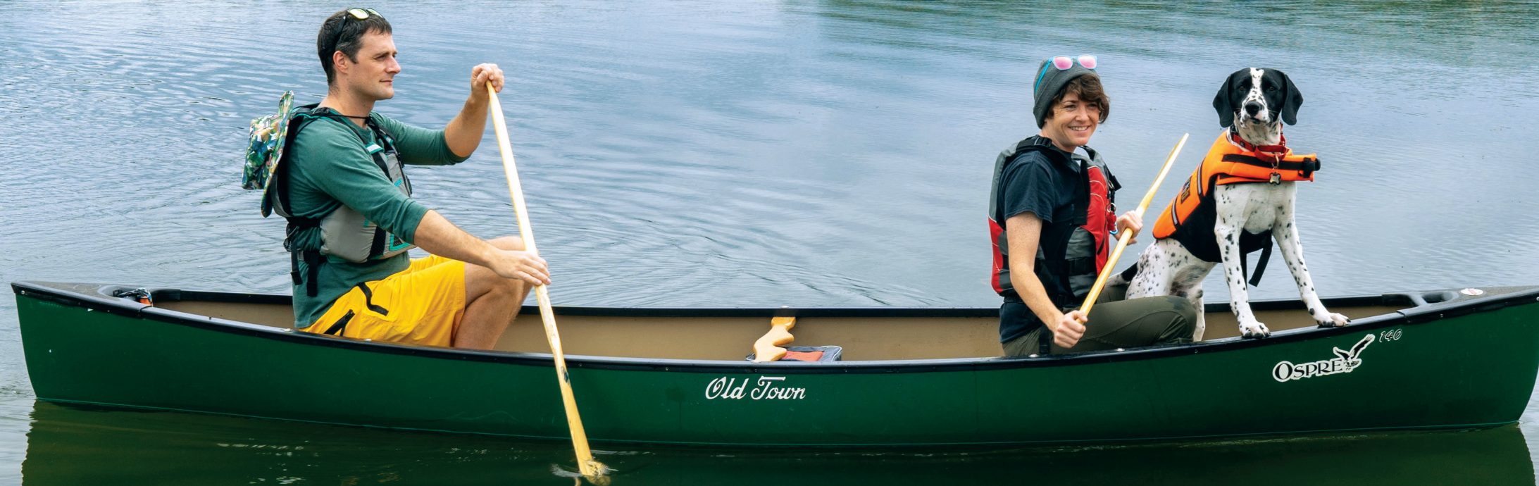
Lake Wawanosh Conservation Area

Huron County is a hub for recreation, boasting a diverse array of activities to suit every interest. Tee off against picturesque backdrops at renowned golf courses, experience the adrenaline rush of Walton Raceway's renowned motocross tracks. Cast your line into pristine waters, paddle rivers and lakes, or climb an indoor bouldering wall. With endless opportunities for adventure, Huron County invites you to discover unforgettable recreation experiences amidst its stunning natural beauty.