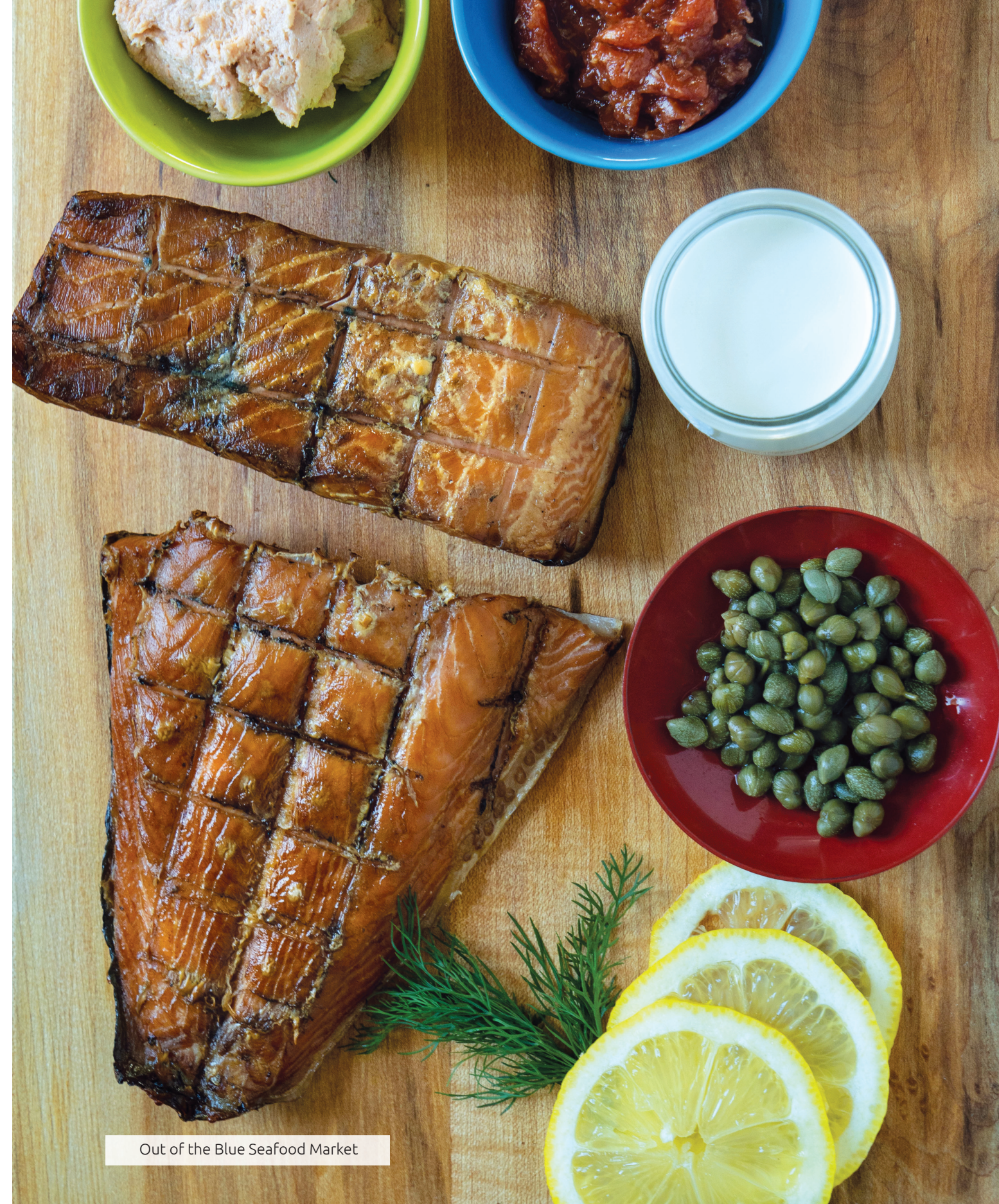
Out of the Blue Seafood Market

Join the locals for a classic, real deal breakfast at Renegades Diner . Grab a coffee from Shopbike Coffee Roasters and explore Bayfield's charming Main Street, brimming with unique shops and galleries. Indulge your sweet tooth at Pink Flamingo Bakery before a satisfying lunch at The Albion Hotel . Stock up on goodies at Bayfield Berry Farm and then head to Out of the Blue Seafood Market for fresh seafood delights. Experience the taste of Huron at Schatz Winery and wrap up your culinary adventure at Dark Horse Estate Winery , where farm-fresh dining at Danu Cellars and incredible wines await against a stunning sunset backdrop. Huron County invites you to savour every bite and moment!