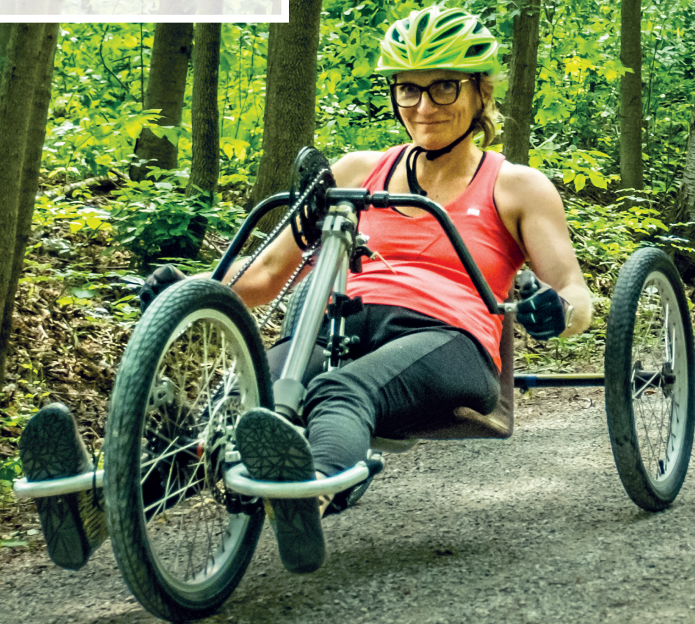
G2G Rail Trail

Discover the stunning landscapes of Ontario's West Coast on two wheels, where every turn of the pedal leads to a new adventure. Huron County's flat terrain and scenic countryside make it perfect for cyclists of all ages and abilities. Ride along peaceful trails, wind through quaint villages, and explore hidden gems nestled in the countryside. As you cycle past thriving farms and orchards, immerse yourself in the region's rich agricultural heritage. Whether you're looking for a relaxing ride or an exhilarating challenge, Huron County offers unforgettable cycling experiences that highlight the natural beauty of Ontario's West Coast.