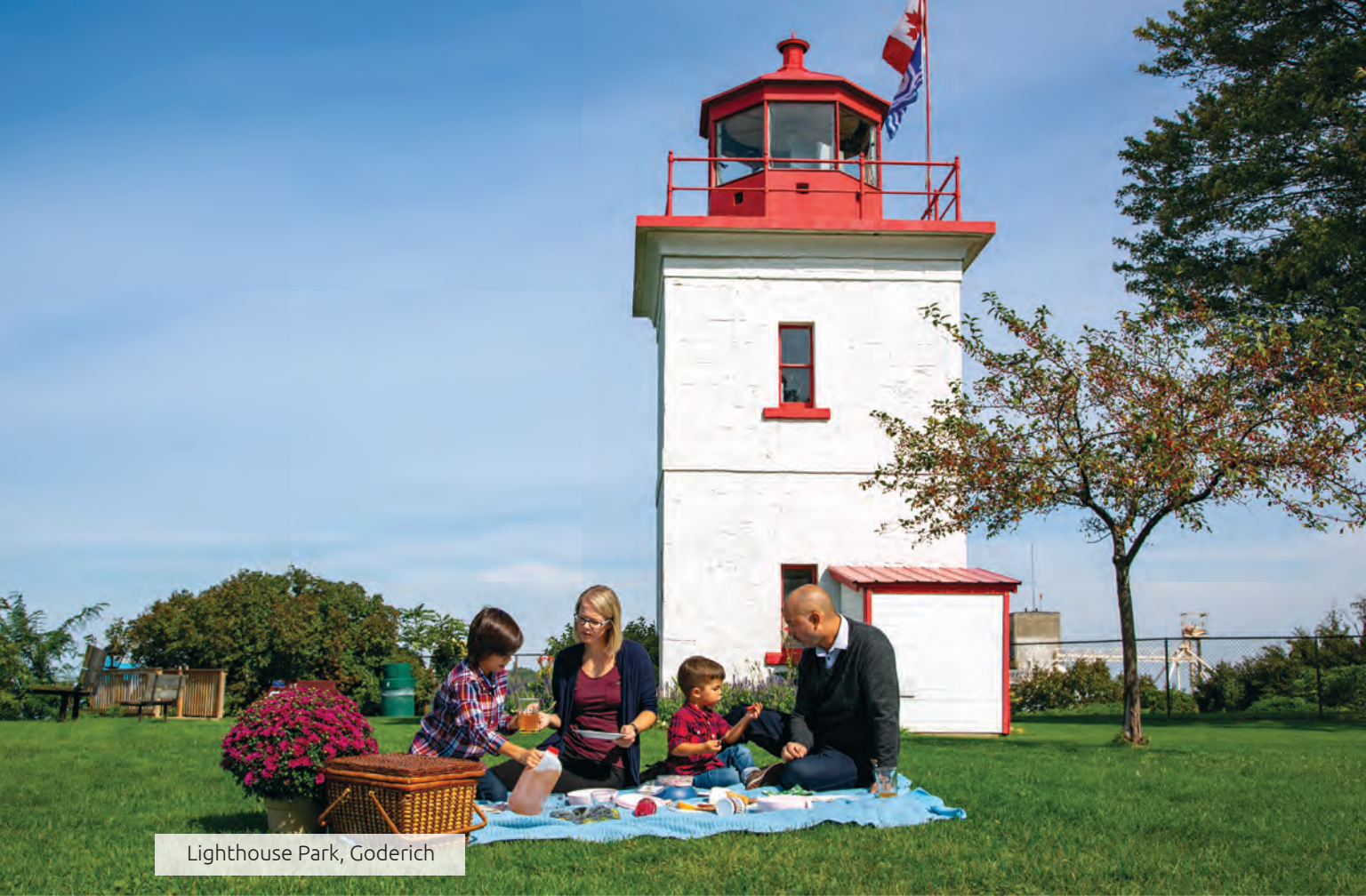
Lighthouse Park, Goderich