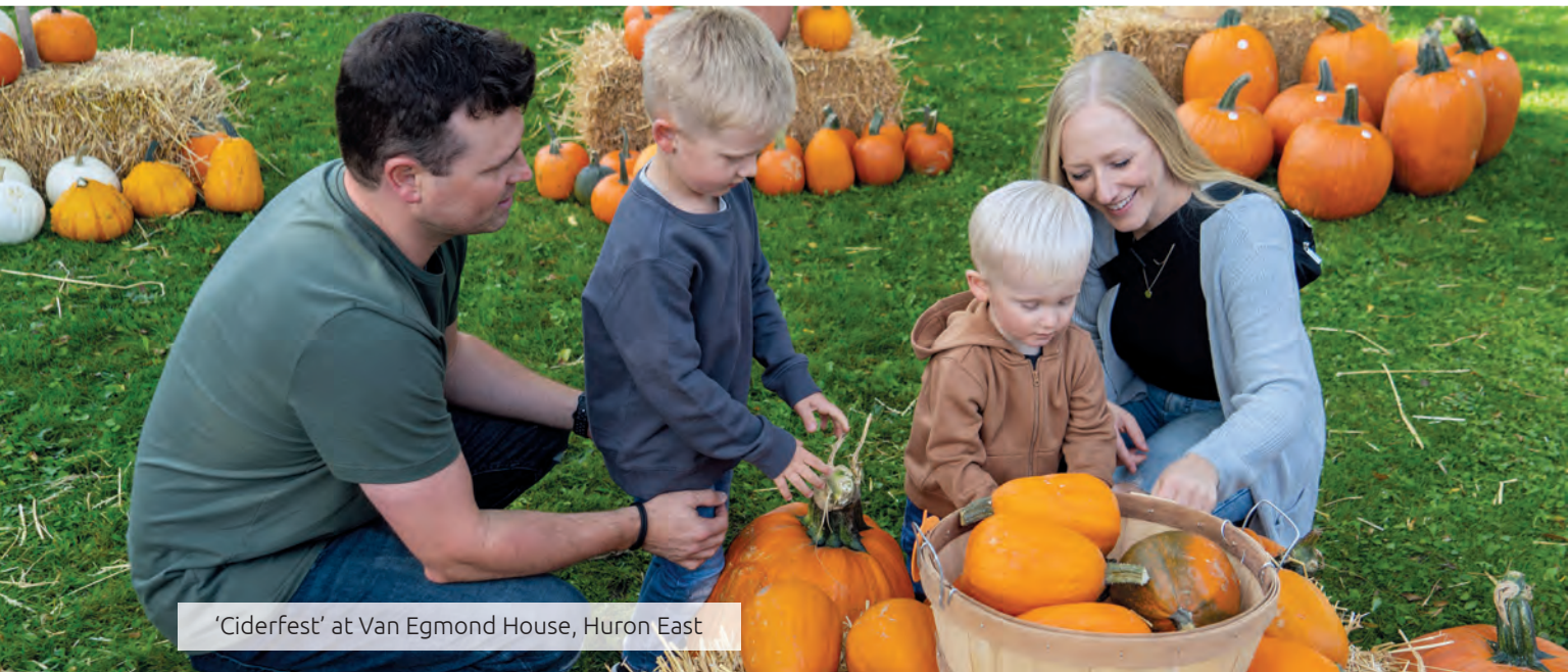
'Ciderfest' at Van Egmond House, Huron East

Source: Statistics Canada - Census Profile. Published In: 2023. Reference Period: 2021.