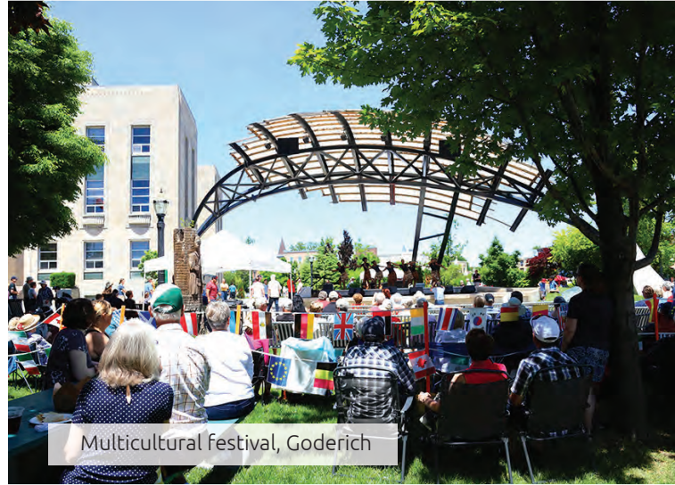
Multicultural Festival, Goderich

Whether you're new to the area or a lifelong resident, it's easy to find your place in the community. Volunteer organizations, sports leagues, arts groups and cultural events provide countless ways to get involved, make connections, and feel at home in Huron County.