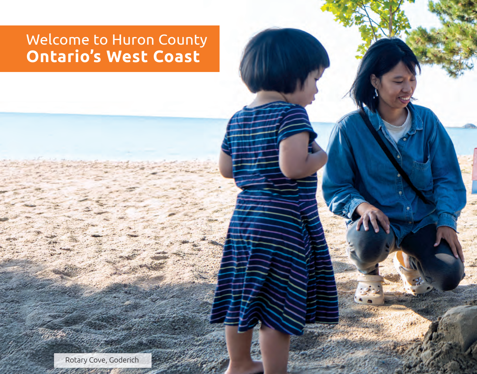
Rotary Cove, Goderich