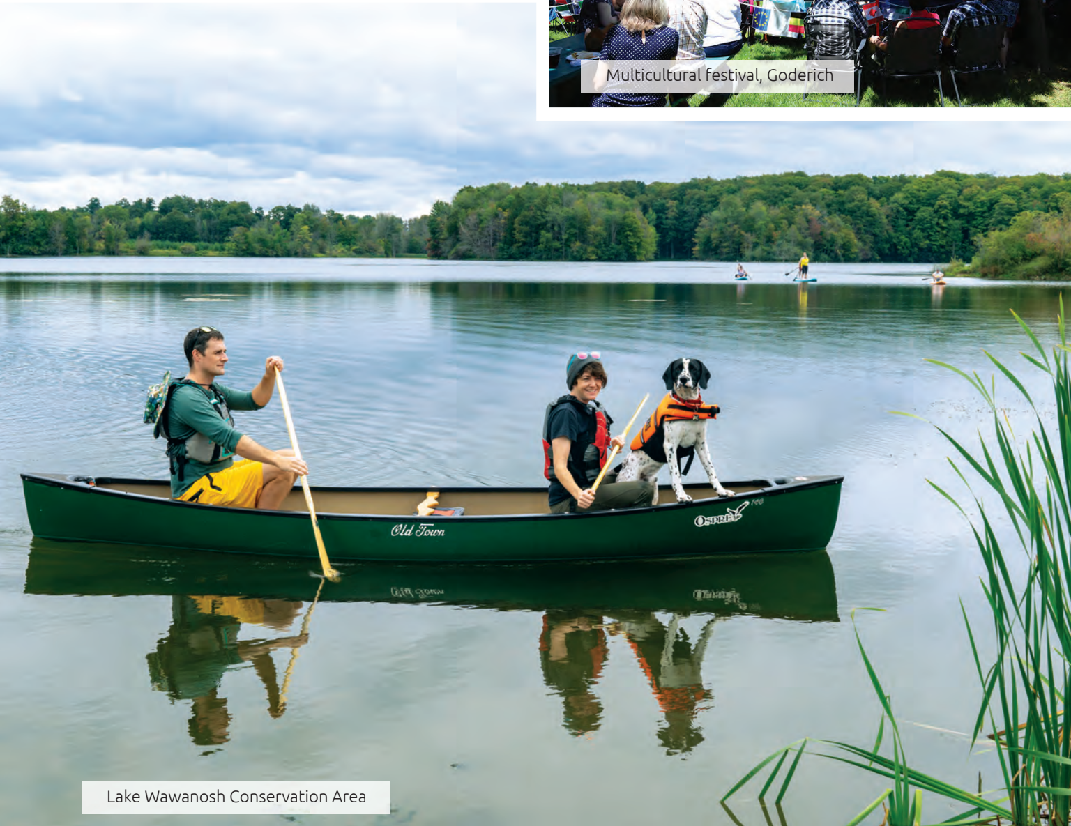
Lake Wawanosh Conservation Area