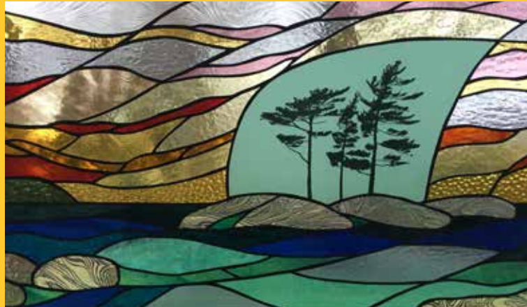
3 Pines Sunset